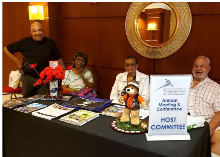
The Host Committee at their welcome table at the Cleveland Marriott.