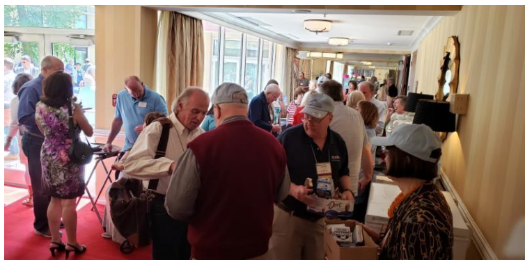
Attendees enjoy an ice cream break hosted by the Congregational Foundation Board of Governors.