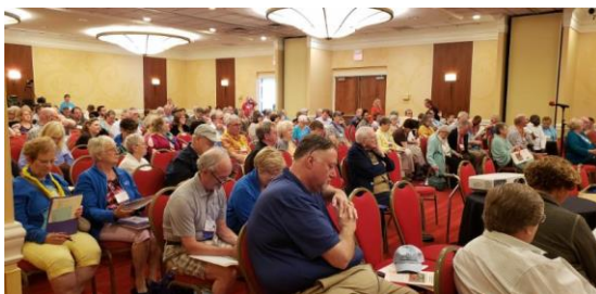
Attendees at the Business Session