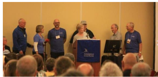
Members of the Plymouth 400 show off their new t-shirts and sweatshirts. See link below to order!