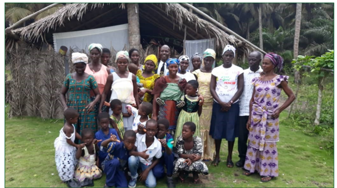
Two new churches added to the ministry of Word Alive Mission, Ghana.