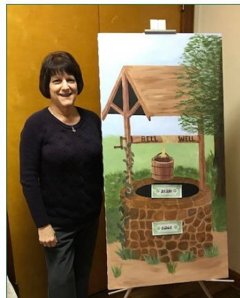
The "Bell Well", a new well soon to be dug for the Mission School of Hope supported by the Grace Church of Columbiana, OH.