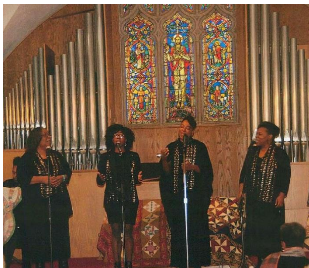
SeVy Gospel Quartet - from "A Harvest of Hope" at People's Congregational Church in Bayport, MN

The family would love to assist you in bringing the marvels of music to life at your church. Visit our website for details and an application. Your church will also receive a brochure included in a packet of information mailed to the church in February. Don't delay, applications due April 15th.