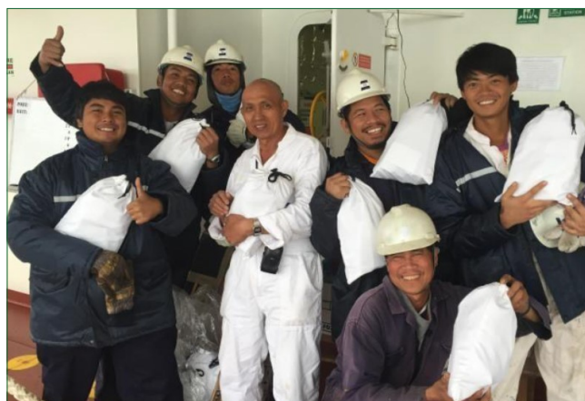
Seafarer's Friend: Goal is to collect 750 Ditty Bags

How to Participate: Pick a goal for you or your team and let Seafarers' Friend know of your goal. Start your shopping, collecting and/or knitting. Take pictures, selfies, or videos of you and/or your group at various stages of the process (shopping, knitting, putting bags together, etc.). Please send us your pictures by Nov 20 th . You can track our progress with the thermometer on our website and Facebook www.SeafarersFriend.org and www.facebook.com/SeafarersFriend/ . Submitted photos or videos may be featured on our website, Facebook page or Twitter page along with your church or individual name next to the thermometer. If you do not want your name being used, please let us know. Please contact us by phone at 617.889.3222 or email us at OperationsManager@SeafarersFriend.org to arrange for pick up or drop off of ditty bags and knitted items. If you have questions, please call us at 617.889.3222 or email us. Thank you.