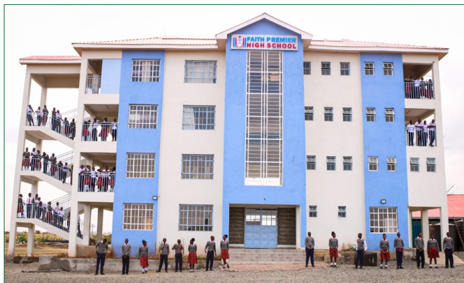
Faith Premier High School