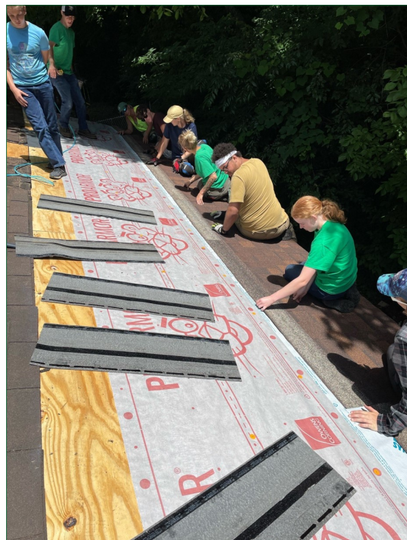
Hosanna Industries: Training volunteers to roof safely

We are starting to prepare for Thanksgiving as well as a Christmas give away. We are continuing to focus on getting wheelchair ramps to those in need.