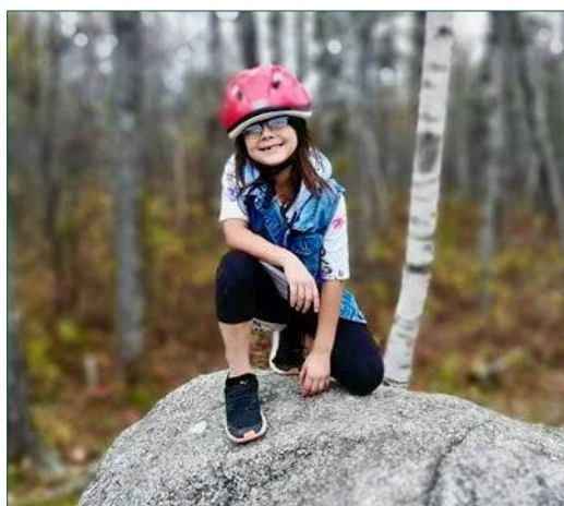
Maine Seacoast Mission Youth Development Program Participant

We also completed a series of COVID-19 vaccination clinics that reached several hundred people on seven islands and in mainland Washington County.