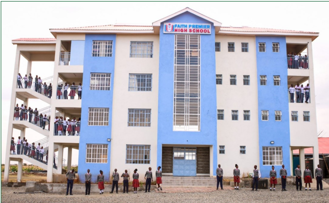
Faith Premier High School