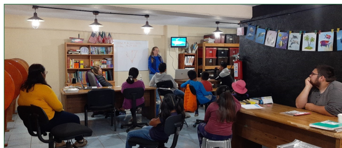
Fishers of Men homeschool classroom