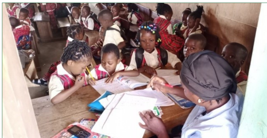
Mission school in Nigeria

From Matthew Oladele: The work of Christ to the Villages continues to focus on the daily activities of the three mission schools (Alpha Nursery and Primary Schools in Shao and Olooru, Omega College Shao) and village ministration (which includes evangelism, visitation and care for the needy). Both young and old are blessed by the word of God that we take to them each time we visit, plus the little material gifts we share. The schools are doing well.