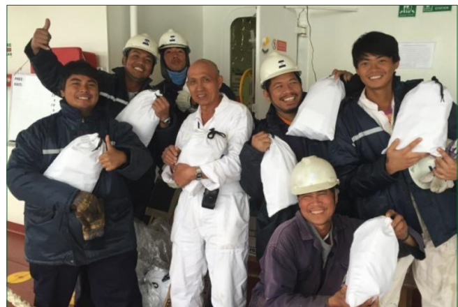
Seafarer's Friend: Goal is to collect 750 Ditty Bags

How to Participate: Pick a goal for you or your team and let Seafarers' Friend know of your goal. Start your shopping, collecting and/or knitting. Take pictures, selfies, or videos of you and/or your group at various stages of the process (shopping, knitting, putting bags together, etc.). Please send us your pictures by Nov 20 th . You can track our progress with the thermometer on our website and Facebook www.SeafarersFriend.org and www.facebook.com/SeafarersFriend/ . Submitted photos or videos may be featured on our website, Facebook page or Twitter page along with your church or individual name next to the thermometer. If you do not want your name being used, please let us know. Please contact us by phone at 617.889.3222 or email us at OperationsManager@SeafarersFriend.org to arrange for pick up or drop off of ditty bags and knitted items. If you have questions, please call us at 617.889.3222 or email us. Thank you.