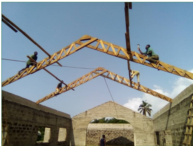
Word Alive Mission: Building the Ekpu church roof

From Rev. Charles Nyane (President): The church at Ekpu has been able to roof their church building. The church started in a small school classroom, then later we bought land, built a structure with sticks and roofed the stick structure with grass. Eventually, we started building the main structure with cement blocks. By the grace of God, the roofing has been done and we at the Mission are grateful for this project. Grateful for the sacrifices of the people and the landmark achieved.