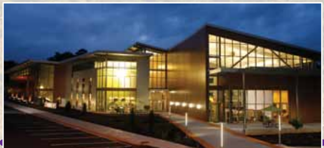
Piedmont College Commons

For those that will arrive by 5:00pm on Friday, June 23, please mark your registration form to note that you will join fellow attendees for dinner in downtown Clarkesville. Piedmont College will provide shuttle service to leave at 5:30pm. If time does not allow for you to join the group for this offsite dinner, a Starbucks café is located on the campus. For those staying at the Hampton Inn, there are a few dining options near the hotel.