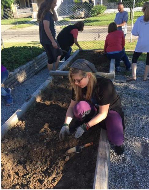
Members from Plymouth Congregational Church of Wichita, Kansas planted a garden together in May.