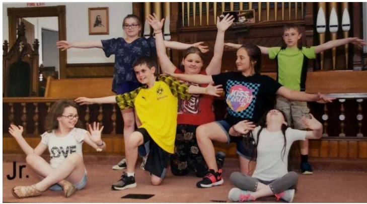
Second Congregational Church of Warren, Maine 2018 Recipients of a John Richard Memorial Endowment grant.