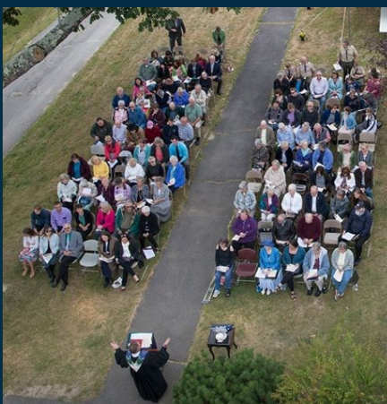
Second Congregational Church, Warren, Maine

Congregational churches have always valued "Fellowship" and have depended upon other churches for advice on important matters.