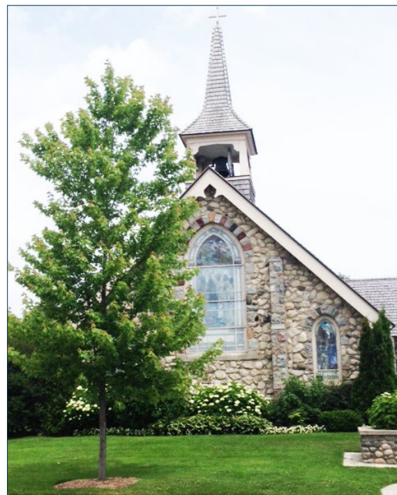
Little Stone Church, Mackinac Island, Michigan

Our Vision: Vital and healthy Congregational Churches, sharing the love of Jesus the Christ.