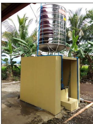
New water system, CMFEI Mission Center