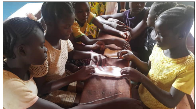
Girls at Mission School of Hope learning how to make reusable sanitary pads.

Hygiene and sanitation are a huge challenge in the Baka community and the most affected are women and girls. Hygiene kits which included reusable sanitary napkins were given out to 20 girls. Because most families can't afford health supplies, girls must skip school for a week due to their monthly menstrual periods. 10 girls have already been trained to make the pads and more will be trained in the future.