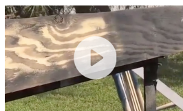
SOOT/SMOKE DAMAGE REMEDICATION

IBOX Abrasive Blasting systems are portable and versatile allowing you to offer quick and easy solutions for: