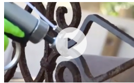
PAINT & RUST REMOVAL