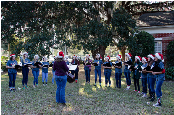
Being serenaded by the Winter Springs High School Choral Group.

Newsletter for the East Central District Florida United Methodist Women