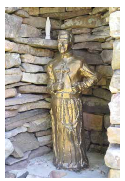
This newly installed statue of Blessed Francis Xavier Seelos is located at the Shrine of Ss. Peter and Paul in Cumberland.

The statue is made of an extremely highgrit ceramic, depicting Blessed Seelos with a slight step forward.