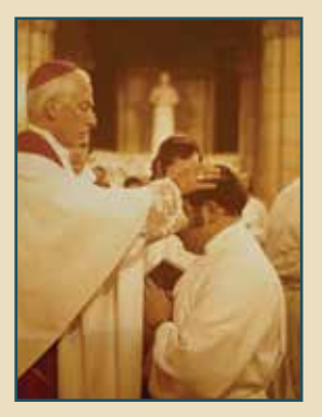
Ordination, June 21, 1973