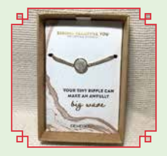
BRACELET - $13

2½" clear glass heart with butterfly design, says "I said a prayer for you"