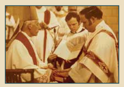
Ordination, June 21, 1973