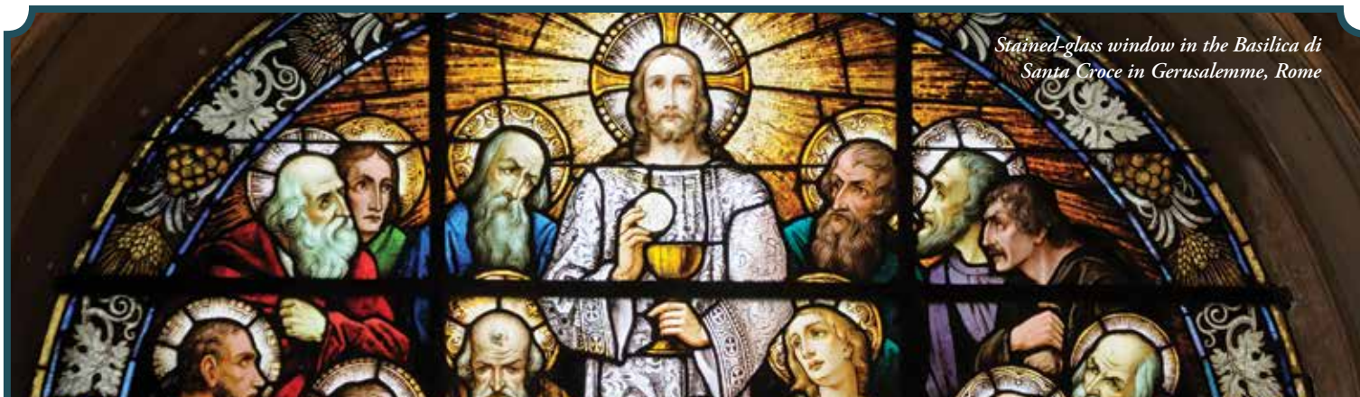
Stained-glass window in the Basilica di Santa Croce in Gerusalemme, Rome