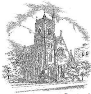
-Drawing of St. Paul's Church by Dan Lyon