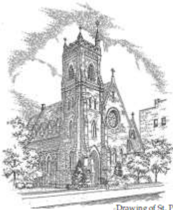
-Drawing of St. Paul's Church by Dan Lyon