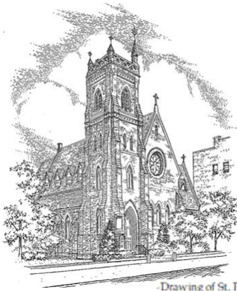
-Drawing of St. Paul's Church by Dan Lyon