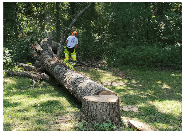
Jeff Clark clearing dead trees near Delaware Cabin.