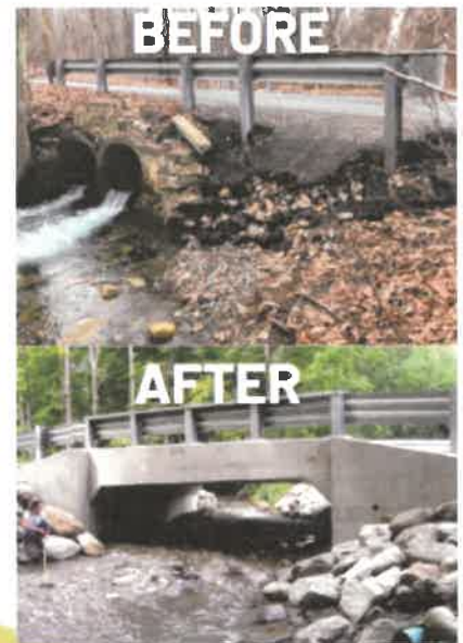
Hancock Road/Churchill Brook Culvert Replacement , Pittsfield

Reduction of flood risk and road closures due to debris clogging the structure or excessive volume overtopping the road.