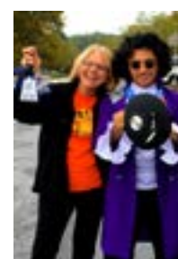
Prince made an appearance!