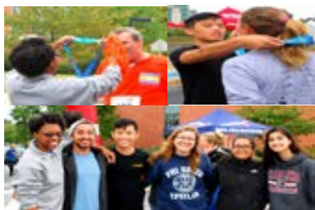
UMBC Phi Delta Epsilon handing out medals to survivors