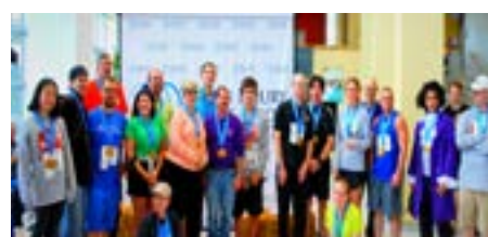
Survivors and their medals!