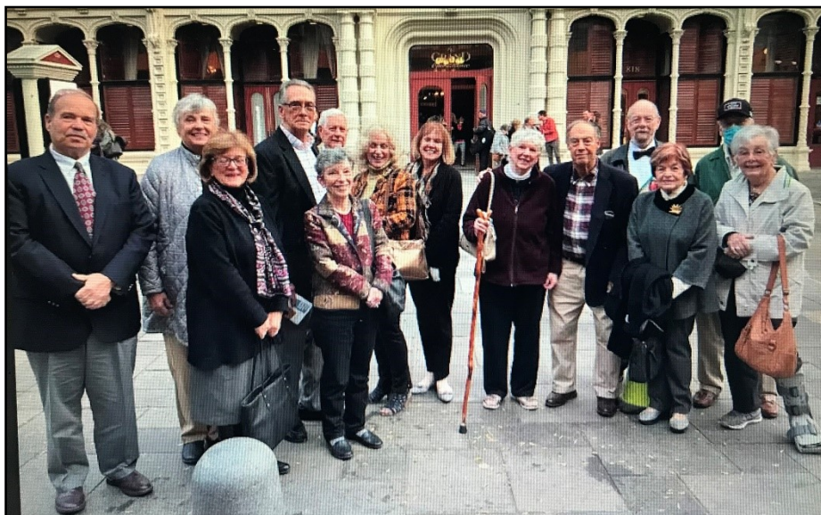
Member attendance at class related Opera and Theatre Performances in Dover is growing as 15 -18 members now regularly travel to see area performances followed by dinner.