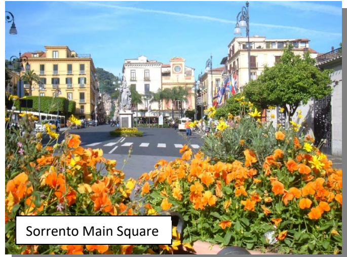
Sorrento Main Square

Day 3 Sorrento - Walking Tour After breakfast, enjoy a guided walking tour through the coastal city of Sorrento, a cosmopolitan place full of stylish and typical Italian artisan shops selling local products and wares. The delightful climate attracted Roman aristocrats in ancient times, who came to Sorrento and built magnificent villas. Today Sorrento is a rich and stylish city. Next, take part in two of our Cultural Discovery Series – Visit Alessandro Fiorentino Collection and learn about wood craftsmanship. Then, learn about the tradition and secrets behind “Limoncello” production. Following the demonstration, enjoy tasting of this famous Italian liqueur. The afternoon is free to relax and enjoy the Italian way. (B)