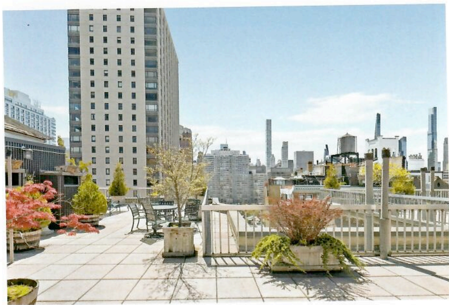
Condominium Rooftop Garden 157 East 72nd Street

The Lobby elevator opens onto this lovely, shared rooftop sanctuary which offers spectacular views. This terrace is a real plus for residents, including the resident gardener, Lisa Meyer. The large, open-flow space supports multiple weather-resistant teak seating areas, which allow different groups to socialize separately. The condo made a commitment to focus on native plants, and the long-time, non-resident gardener has not only done that but also has selected planters made from only natural, sustainable materials such as stone, clay, and wood—note the wonderful wooden barrels. Fiberglass and plastics are verboten! Multiple plantings enhance each seating area providing enchanting combinations of sizes, colors and textures for all residents and visitors. On the East Terrace, note the charming fountain and purple Clematis climbing up the wall. In the North, note the flat bed planted with edibles for residents to harvest and eat. The Juniper tree to its right was brought here by a bird seven decades ago. Don't miss the low-lying Fig tree originally planted by an eminent judge who, before the formal landscaping, had his own rooftop vegetable garden here.