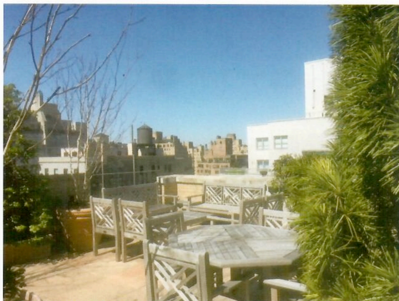
Valerie and Mark Mashburn 50 East 72nd Street, Penthouse Garden

In a 1928 pre-war building off Madison Avenue, old-school charm and elegance pervade this stately penthouse and wrap-around terrace owned by Valerie and Mark Mashburn. Enter the apartment foyer through the private elevator landing into the formal dining room with its beautiful hardwood floor and crystal chandelier. Proceed to the entertainment area of the terrace. Splendid Umbrella Pines frame the window and the white Hydrangeas below. Climbing Hydrangeas wind their way over an arch, flanked by delicate Birches. The North passage is lined with Boxwood, trellised New Dawn Roses, Rhododendron, and Birches. Dark green Ivy and Mandevilla Vines ascend the walls. There are a variety of teak furniture seating areas artfully arranged throughout the terrace. The areas are useful for entertaining, whiling away the day, watching glorious sunsets and gazing at the stars. Note the vista across Central Park to The Dakota on the West Side. On the Southern Terrace Birch trees flank a mature Spirea shrub. Trumpet vines and English Ivy climb the ornamental garden tower. Short pots contain Limelight Hydrangeas. Fragrant flowers and plants popular with pollinators are tucked between the Birches to create a calm, classic rooftop retreat.