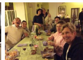
Be fed and transformed