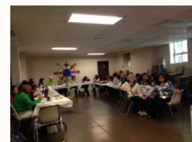
Listen, reflect, envision

PARTICIPANTS WILL ENGAGE IN STRUCTURED CONVERSATIONS AND COLLABORATIVE VISIONING, TO SHARE PRACTICES THAT WILL SUSTAIN US IN OUR WORK OF GLOBAL RENEWAL.