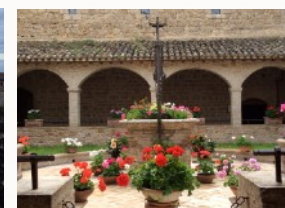
San Damiano, birthplace of the revolution of tenderness

PARTICIPANTS WILL LISTEN DEEPLY TO THE WAYS THAT OUR WORLD CRIES OUT FOR CHANGE, SOLIDARITY, REMEDIATION, AND CREATIVITY.