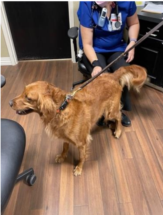
Jessie says, “Yes, right there!”