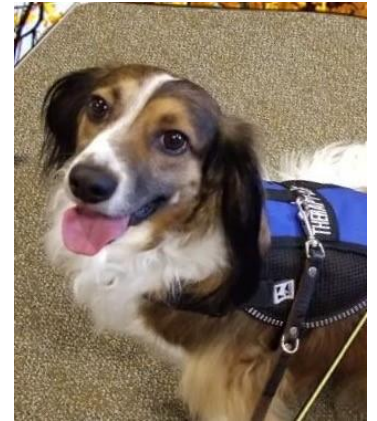
Yogi wants one too!