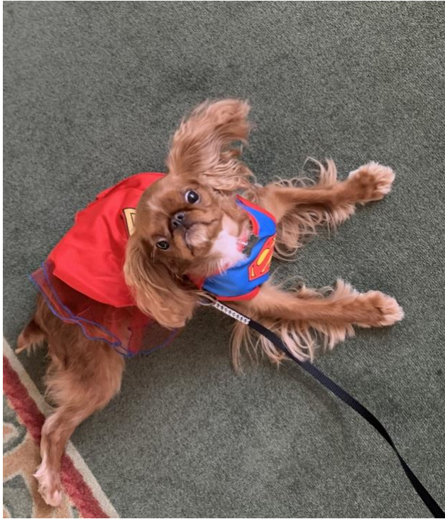
Darcy in her Supergirl Costume