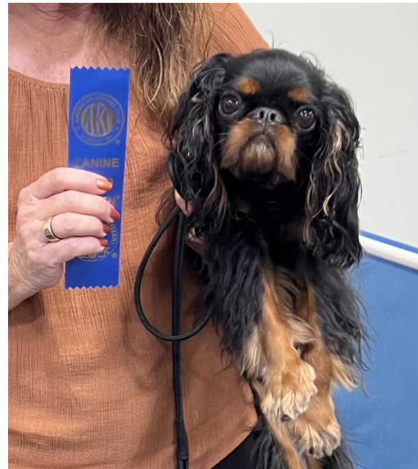
Dash with his Canine Good Citizen Ribbon