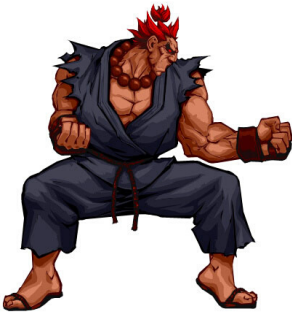
Akuma, the secret boss of Street Fight 2 Turbo