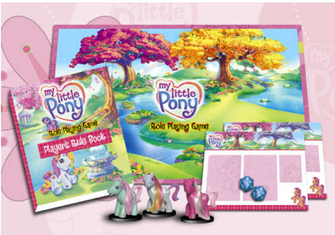
The Fake My Little Pony Roleplaying Game

Today a roleplaying game based on My Little Pony might not seem that odd, but in 2006 the franchise was in hibernation. My Little Pony was popular way back in the 1980s with its iconic toys and cartoon series, but nothing new or exciting had come out in years.