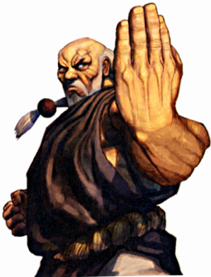
Gouken from Street Fighter 4

Many years later in Street Fighter 4 a new character named Gouken appeared who looked an awful lot like the images of Sheng Long. While his name was a little different, the elusive character had finally appeared in the game and this time, you didn't even have to do anything special to fight him. You can even play as this April Fools legend!