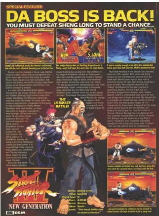
They Don't Give Up, Do They?

It seems Capcom liked the idea of the secret boss, because in Super Street Fighter 2 Turbo they added one in. Fortunately for players the rules for fighting him weren't as insane as the fake ones posted in the EGM April Fools' article. However, the character didn’t fit the description of Sheng Long, leaving some disappointed. Some fans got hopeful when EGM reported Sheng Long would be in Street Fighter 3, but this was just another April Fools joke!