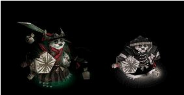
Some concept art of the Pandarens

Pandarens, as we learned, were giant panda people that were as cute as they were deadly. The announcement included concept art, unit descriptions, and in-game models. People were very confused. This was long before the movie Kung Fu Panda, so no one had really seen anything like this before. It was silly. The Pandarens looked wrong next to the fearsome Tauren Warriors and creepy Undead Ghouls. Of course it was just a joke. And a really good one.