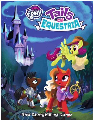
The Real My Little Pony Roleplaying Game

This is why it was hilarious when Hasbro announced the d20 My Little Pony RPG. Hasbro owned the rights to both My Little Pony and the popular RPG Dungeons and Dragons. They announced a new game that would bring the two together. No longer would players play brave warriors that slayed vicious monsters with swords and spells. Instead they would play cute ponies who solved their issues with friendship and kindness. These changes definitely would have caused a huge uproar, so of course it was just a joke. This prank was extra funny because of the nostalgia as most people probably hadn't thought about my Little Pony in a decade.