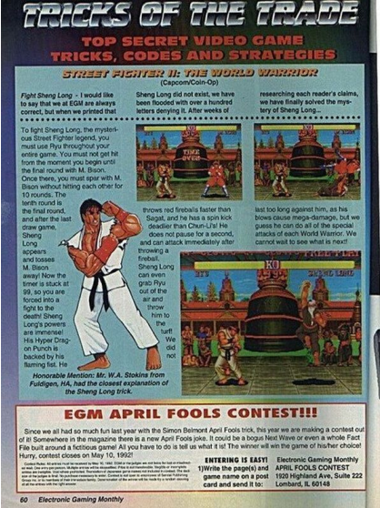
The Original Article

First off, it is important to know is that there is no Sheng Long in Street Fighter 2. That fact didn’t stop EGM from writing an article about how you can fight him in the game. The article said you had to beat the game multiple times playing as Ryu (who said the quote) without taking a single hit in order for Sheng Long to appear and challenge you. They even faked some screenshots and drew some concept art to make it look like this secret character actually existed. This was before most people had the internet so I’m sure many players, not knowing it was a prank, were really frustrated as they tried to complete the almost impossible task of beating the game perfectly multiple times only for absolutely nothing to happen when they did it.