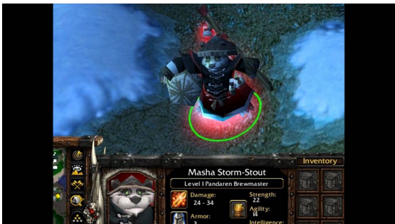
Pandaren from Warcraft 3

Blizzard didn't. In 2011 at Blizzcon the company announced a new expansion for World of Warcraft. The title? Mists of Pandaria. Players all checked their calendar, but it was October 21st not April 1st. The Pandas were going to be a real thing!