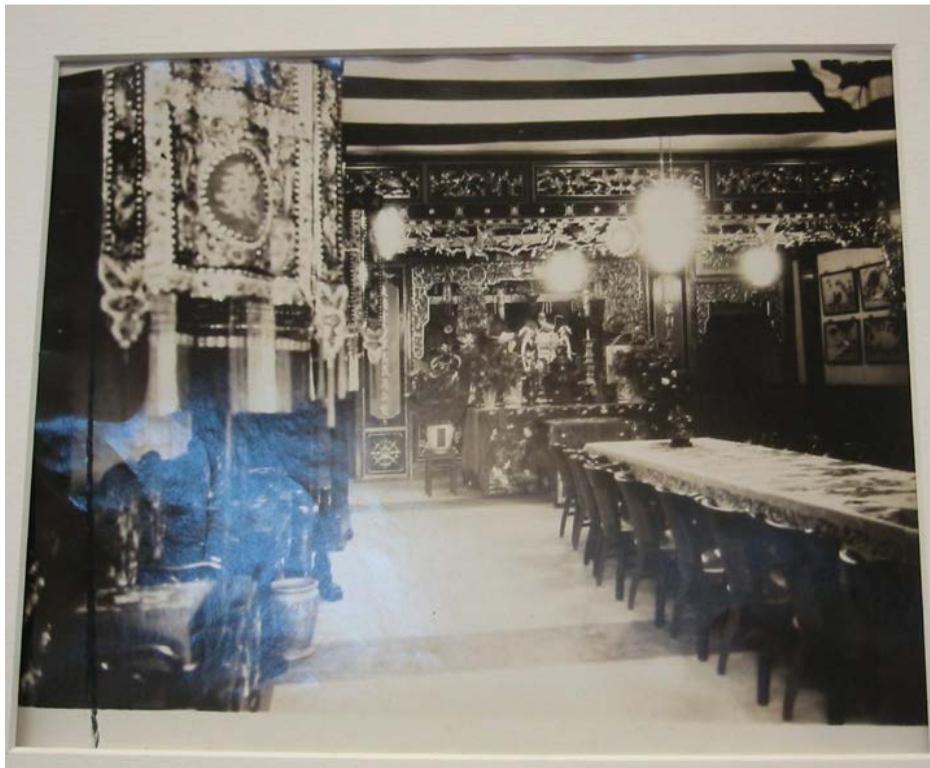
inside of On Leong Tang on Rockwell 2nd floor