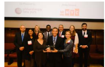
Per Scholas Bronze Prize

Cash prizes and scholarships for the Columbia Business School Executive Education Programs in Social Enterprise will be awarded to the three winners. The three runner-ups- New York City Outward Bound Schools, New York Peace Institute, and The Children's Aid Society - also received over $31,000 in scholarships to the Columbia Programs. Visit http://npccny.org/npexcel10 to view full press release.