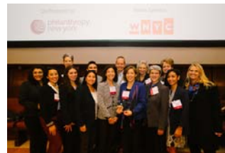
Neighbors Link Silver Prize