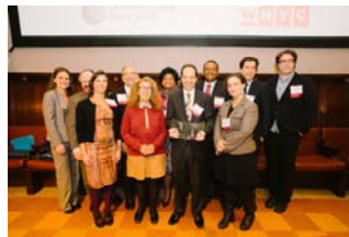
Jewish Board Gold Prize