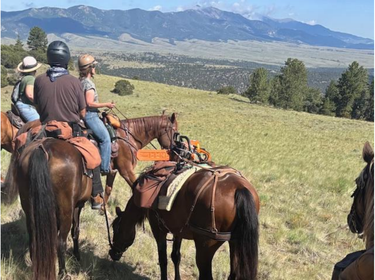
Work Crew with Pack Horse Carrying Chainsaw