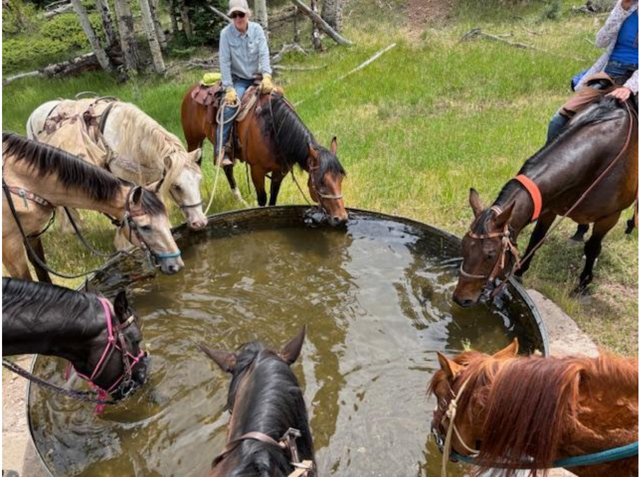
Work Crew Horses Having a Well-Deserved Drink