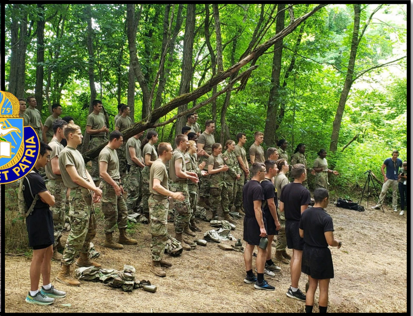
The cadets enjoying the Worship music together by singing and clapping along