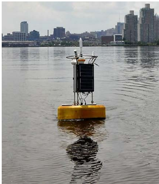
NOAA Buoys (4 stations)