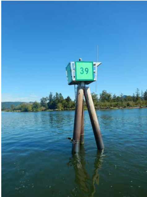
Huntington Island Light