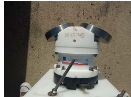
Horizontal mount ADCP - “Sidelooker” (13 stations)