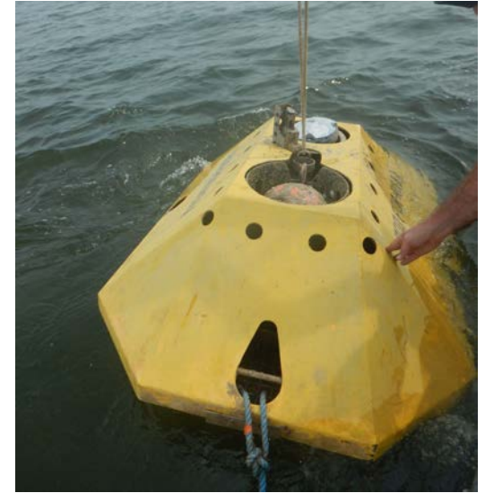
Bottom mount (2 stations)