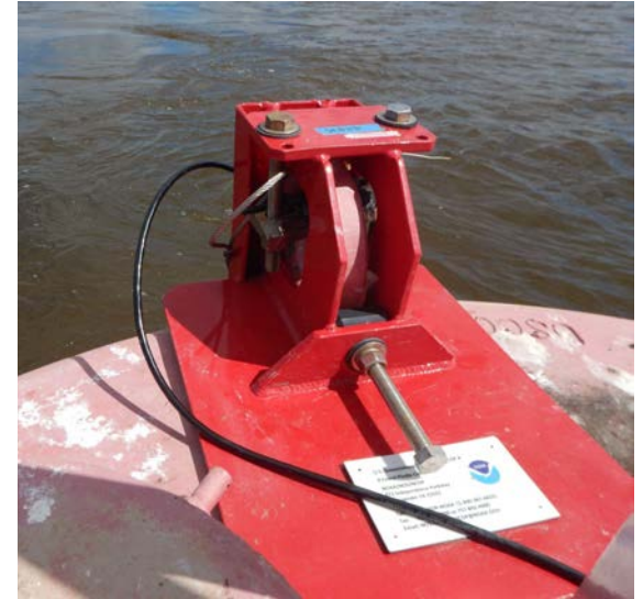
Close ups of ADCPs mounted on USCG ATONs