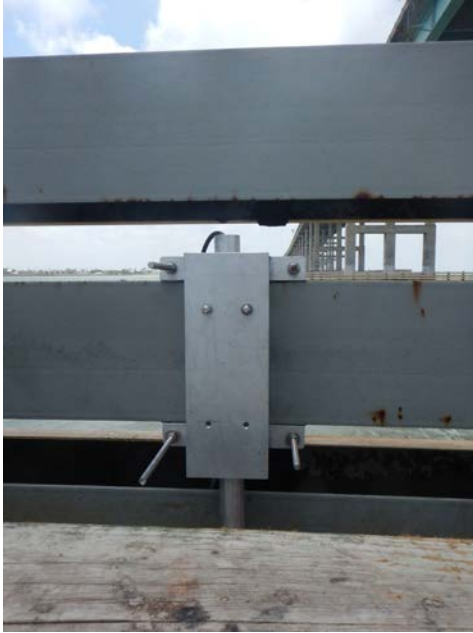
Additional Sidelooker set-up examples