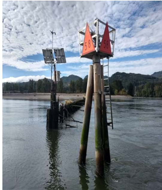
Westport Dike Light