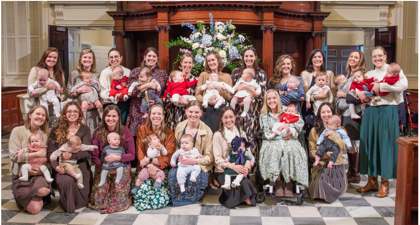
MANY OF THE 24 BABIES BORN INTO THE CHURCH IN 2025