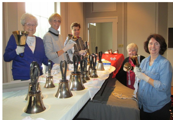
Cleaning the handbells back in 2018!

Even if you have never picked up a handbell or can't read a note of music, you are still strongly encouraged to try it out. The music is arranged to fit your skill level, and we always have a great time.