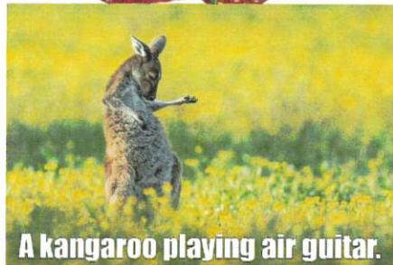
A kangaroo playing air guitar.

I got my wife to help me put some posts in the ground for our new fence, I gave her the new hammer and I said, "When I nod my head you hit it" I don't remember much after that.