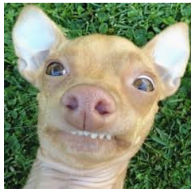
And then the fight started.....