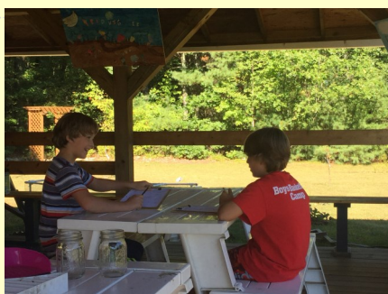
Science in the outdoor classroom

**Lesson explanations are available at PearsonRealize.com The girls each have their own