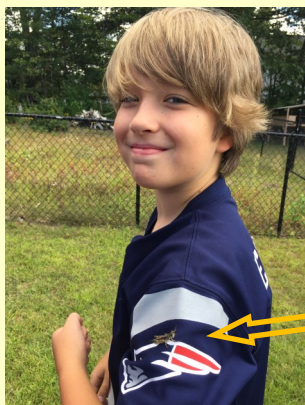
See the grasshopper?

We are setting the stage for weather studies with a review of topics like the water cycle, clouds, and heat transfer. Look for a quiz coming up the week after next.