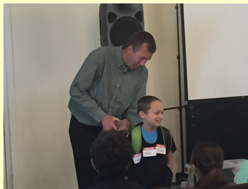
A lesson on the burden of unforgiveness during Spiritual Emphasis Week