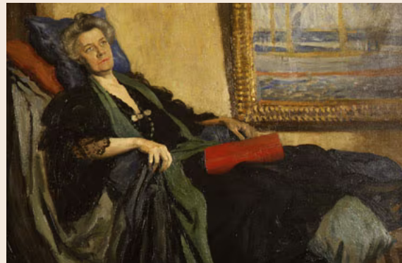
Six Scholars. Six Books (Virtual)