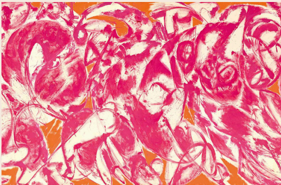
Art Pioneers: Women of Abstract Expressionism (Virtual)