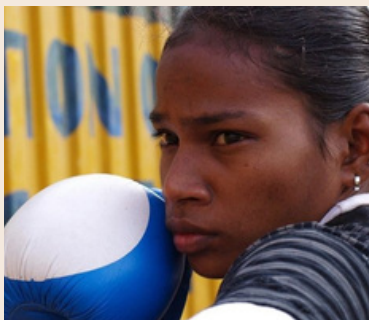
LIGHT FLY, FLY HIGH (2013)