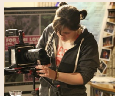
A Presentation of Short Films by students of Sarah Lawrence College