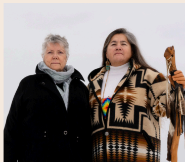
WITHOUT A WHISPER (2020) and WOMEN ORGANIZE! (2000)