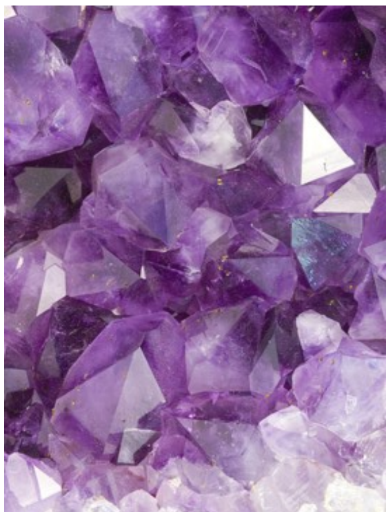
Above: Detail of Amethyst Crystals

The Museum's hours are Tuesday-Saturday from 10 am-5 pm. For more information about this exhibit and other displays, events, programs and activities, please contact the Museum at 979-776-2195, visit them on the web at brazosvalleymuseum.org , or follow them on Facebook . Regular Museum Admission fees: adults $5; seniors/students/children $4; members and children 3 and under are free.