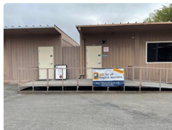
Adult School Main Office at Paly P11