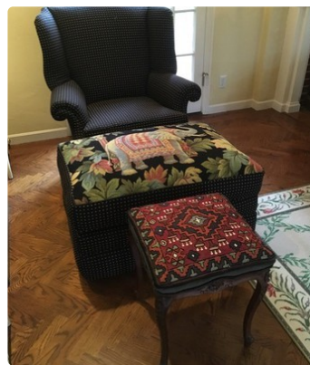
WingBack Chair and Elephant Ottoman