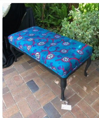
Bench Sold in Gamble Garden 2019