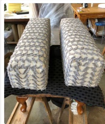
Two Recovered Bolsters