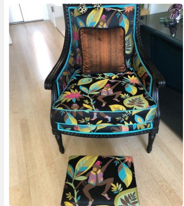
Footstool to Match Customer's Chair