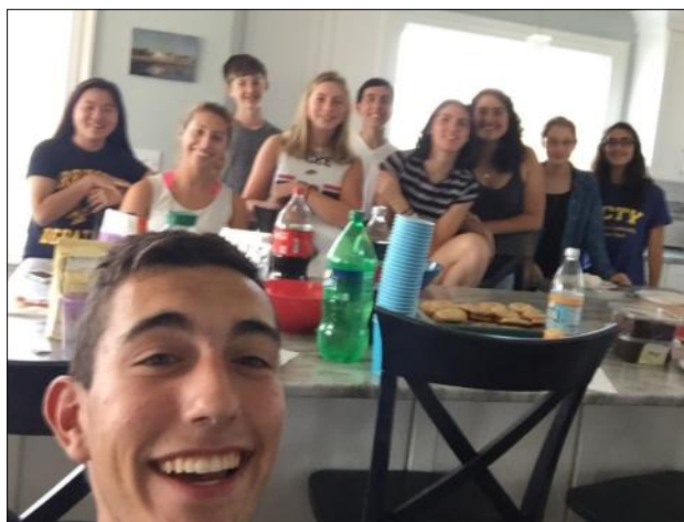
BCTY having fun at their first meeting of what looks to be a great year.