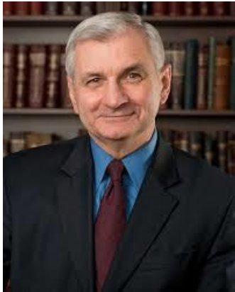
Senator Jack Reed