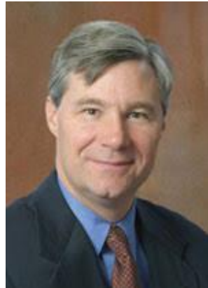
Senator Sheldon Whitehouse