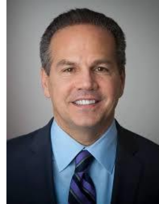
Representative David Cicilline