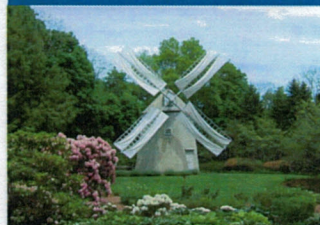
One of Cape Cod's many Windmills