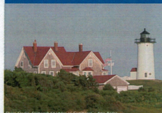
Lighthouse overlooking Vineyard Sound