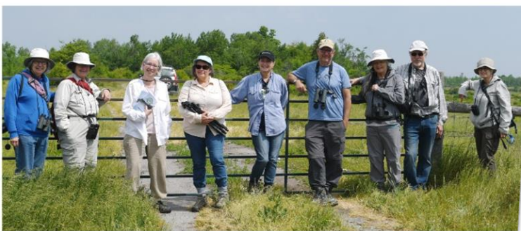
Participants of the Grassland Bird Walk Hike, and the Paddle Party on the Black River.