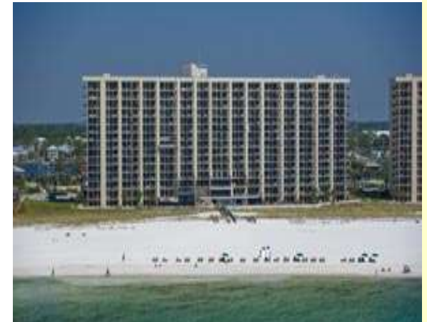
Summer House Orange Beach, AL