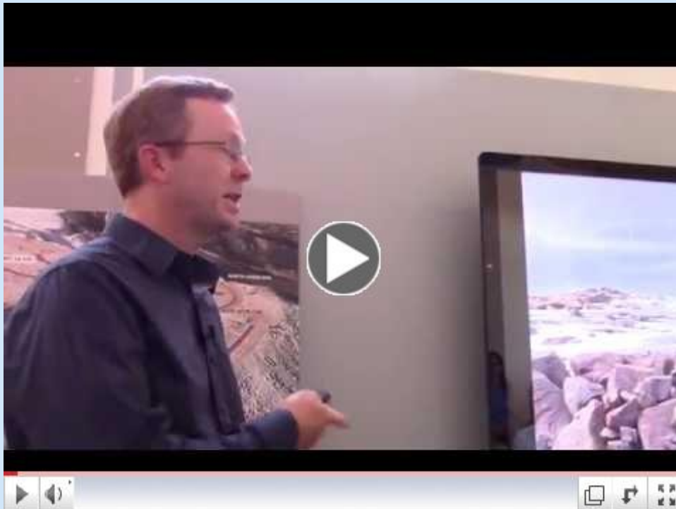
What's On Top of Pikes Peak (2:21)