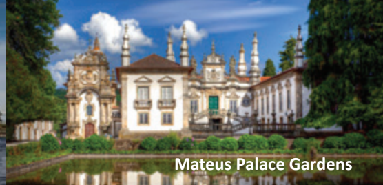
Mateus Palace Gardens