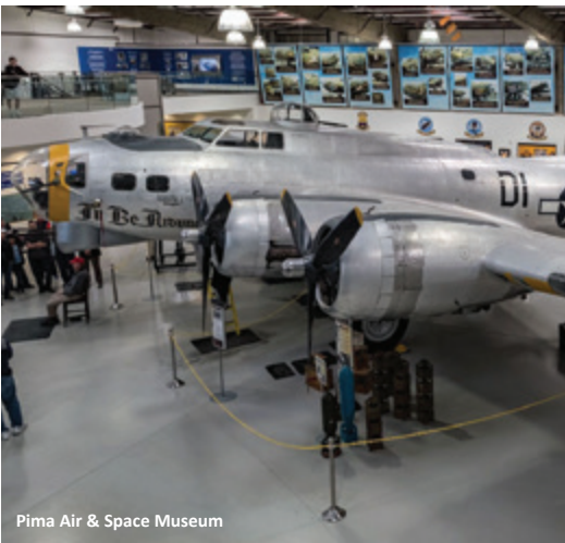
Pima Air & Space Museum