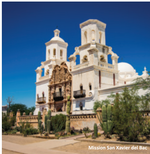
Mission San Xavier del Bac