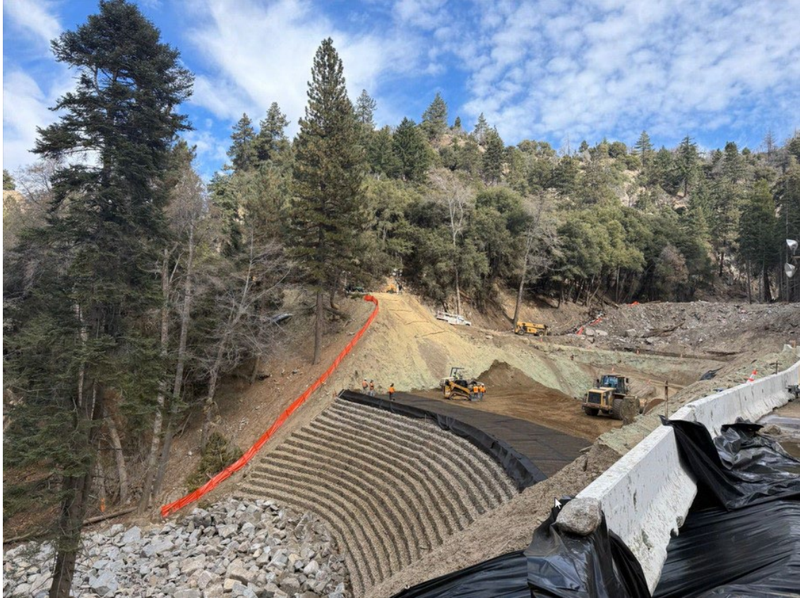
Postmile 23.90 Gabian Installation at Washout Location