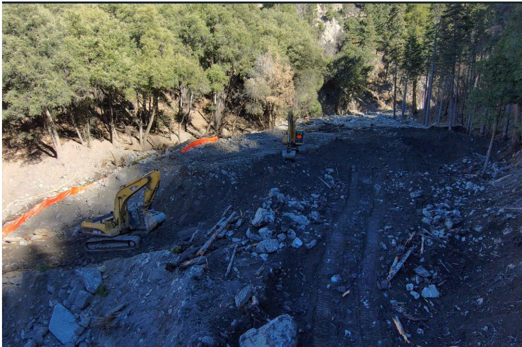
Main Washout Location, postmile 23.90