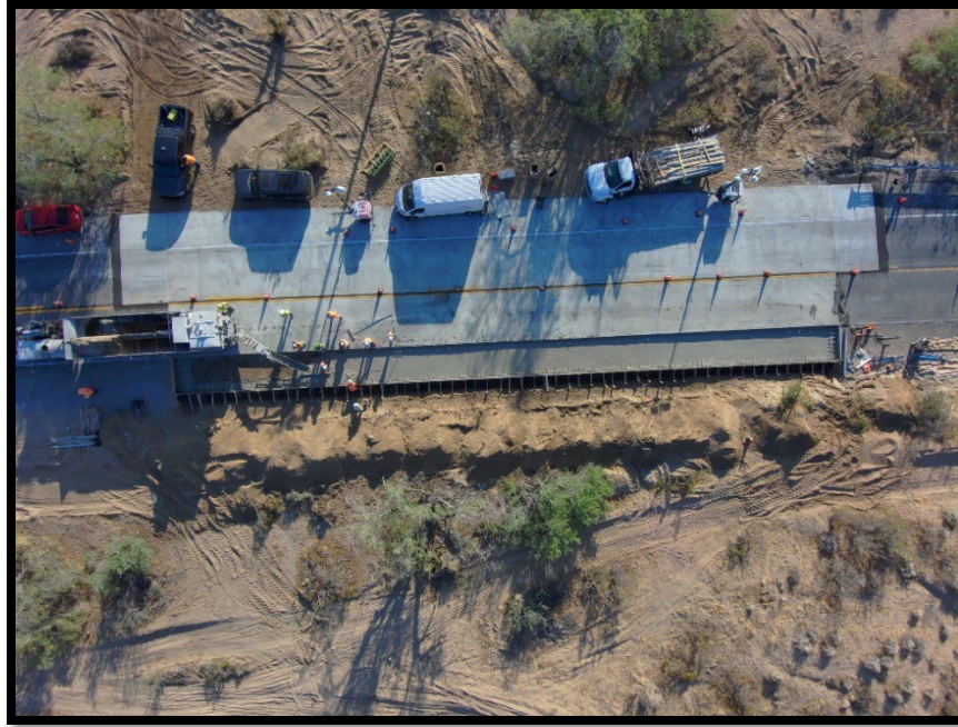
Figure 1 June 2025 Concrete Pour

Week of August 10 th Work Schedule: Nightly paving operations continue from Sunday to Thursday 7:00 p.m. to 6:00 a.m. Northbound SR-247 lane closures with flagging operation will begin near Gleason Rd. Friday and Saturday night work may occasionally be required from 7:00 p.m. to 6:00 a.m.